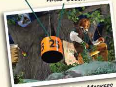
INTERNATIONAL AISLE MARKERS